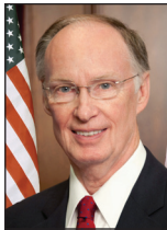
ROBERT BENTLEY Republican