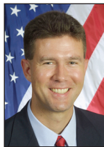
JOHN MERRILL Republican

FOR COMMISSIONER OF AGRICULTURE AND INDUSTRIES (Vote for ...)