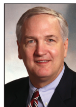
LUTHER STRANGE Republican

INSTRUCTIONS TO THE VOTER TO VOTE YOU MUST BLACKEN THE OVAL COMPLETELY! DO NOT MAKE AN X OR ✓