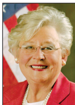
KAY IVEY Republican