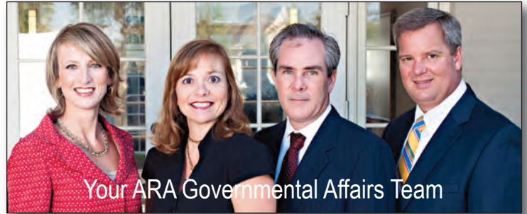
Your ARA Governmental Affairs Team

At its Nov. 15th meeting, the Alabama Retail Association board of directors approved this legislative agenda for the 2013 regular session of the Alabama Legislature. During the session, which begins Tuesday, Feb. 5, and will end by Monday, May 20, ARA will monitor all bills with the potential to impact retailers.