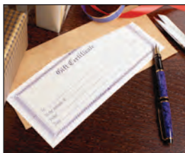
ARA opposes “custodial taking” of unused gift card balances.

“CUSTODIAL TAKING” legislation that pushes unused gift-card balances to the state treasury when those balances go unclaimed.