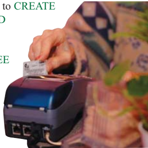
ARA supports fairness for retailers on late fee charges for consumer credit transactions.