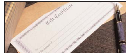
ARA opposes legislation restricting expiration dates on gift cards or certificates. ARA also opposes legislation advocating "custodial taking" of unused balances on gift cards.