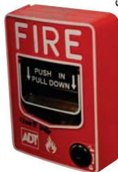
ARA supports legislation to make the punishment greater when thieves make their escapes through emergency or fire exits.