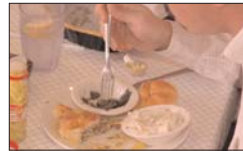
Nine of 10 Americans say it's wrong to hold food companies liable for obesity-related health problems. ARA agrees.