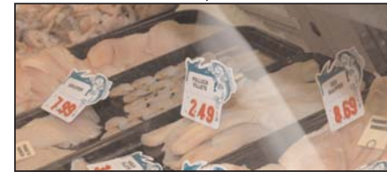
ARA opposes mandatory country of origin labeling at the state level on such products as seafood, meat, fruits, vegetables and peanuts. ARA favors a voluntary consumer-driven system.